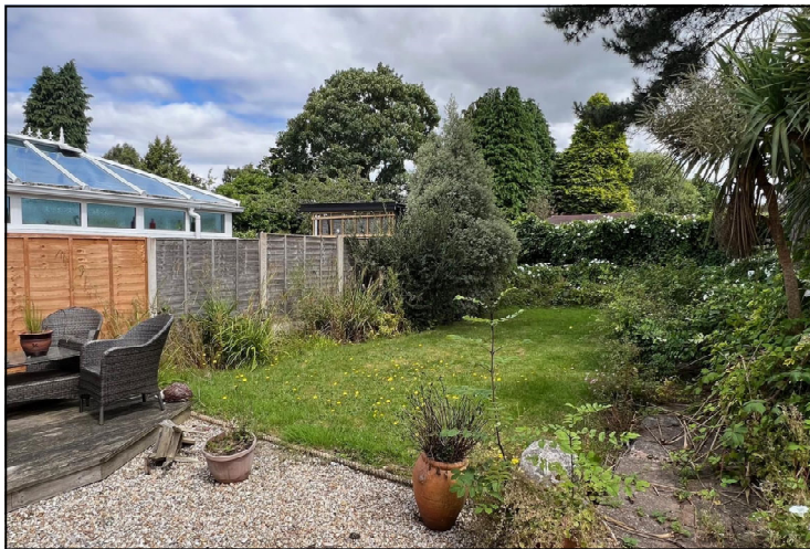
Grange Lane, Sutton Coldfield, B75 5LB